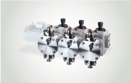
LEWA ecoflow hygienic Diaphragm metering pumps in a flexible modular system for medium to high pressures in the pharmaceutical, cosmetics, and food industries.