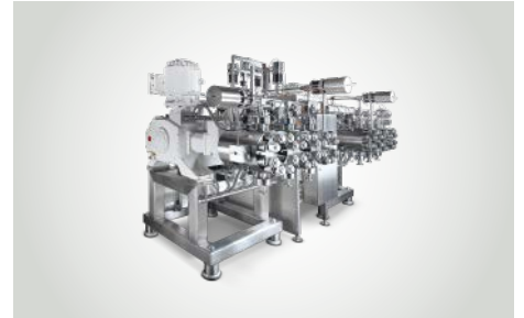
LEWA triplex hygienic Process diaphragm pumps for high pressures and critical, toxic, flammable, thin fluids, non-lubricating fluids, or abrasive suspensions.