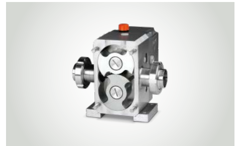
Pomac* Rotary lobe pumps for hygienic standard applications up to complex sterile applications with thin fluid, viscous or shear-sensitive media.