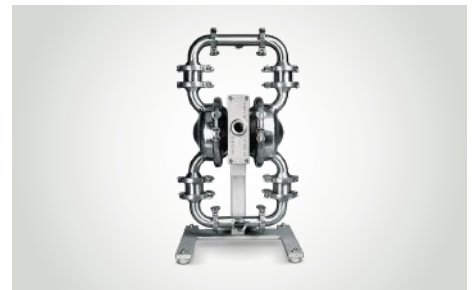
WILDEN hygienic* Compressed air pumps for the gentle transport of shear-sensitive products in the hygiene and sterile sectors