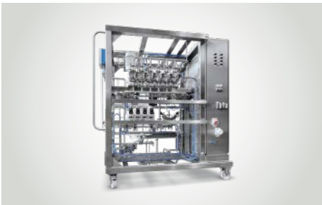
Customized LEWA systems Tailored solutions for various Clean Markets applications, such as buffer inline dilution systems or dosing systems.